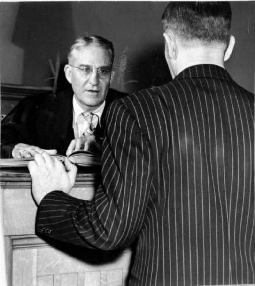
Judge Paul S. Carroll. Defendant pleads guilty before Judge Carroll. Date: 1947.