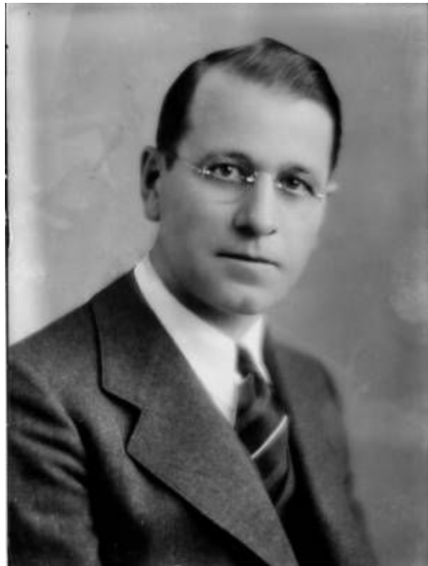
Judge Vince A. Day Date: February 21, 1938.