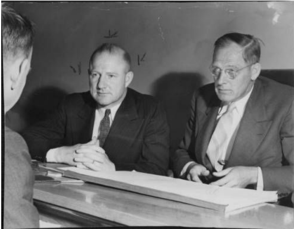
Judge Earl J. Lyons on left, Judge Fred B. Wright on right. Photograph taken: September 2, 1941.