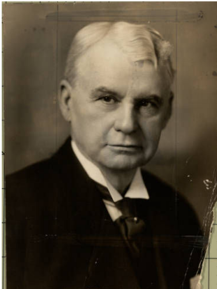
District Court Judge W. E. Hale Date: October 5, 1916.