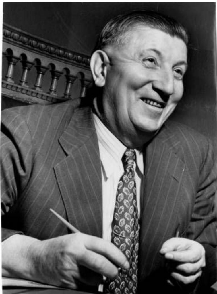
James G. Kehoe Judge of Probate Court, Hennepin County District Court Date: January 10, 1947