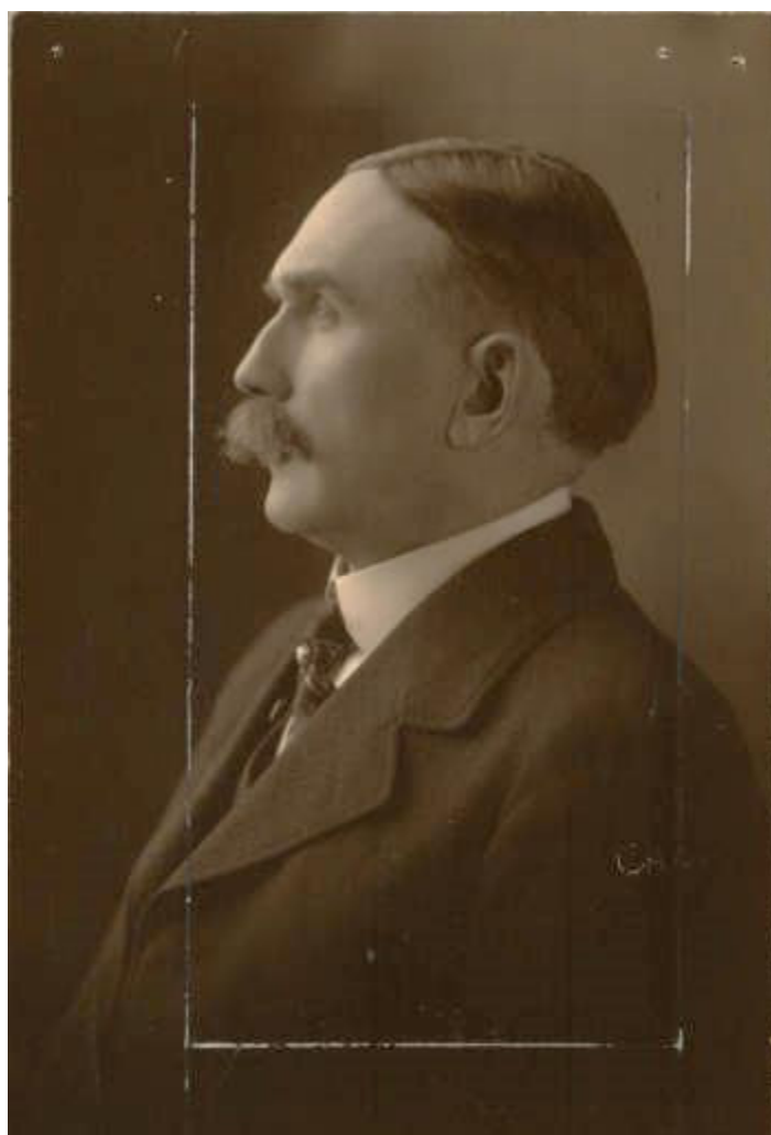
Judge Thomas H. Salmon Appointed to District Court bench by Governor Burnquist in 1917 Date: April 4, 1917.