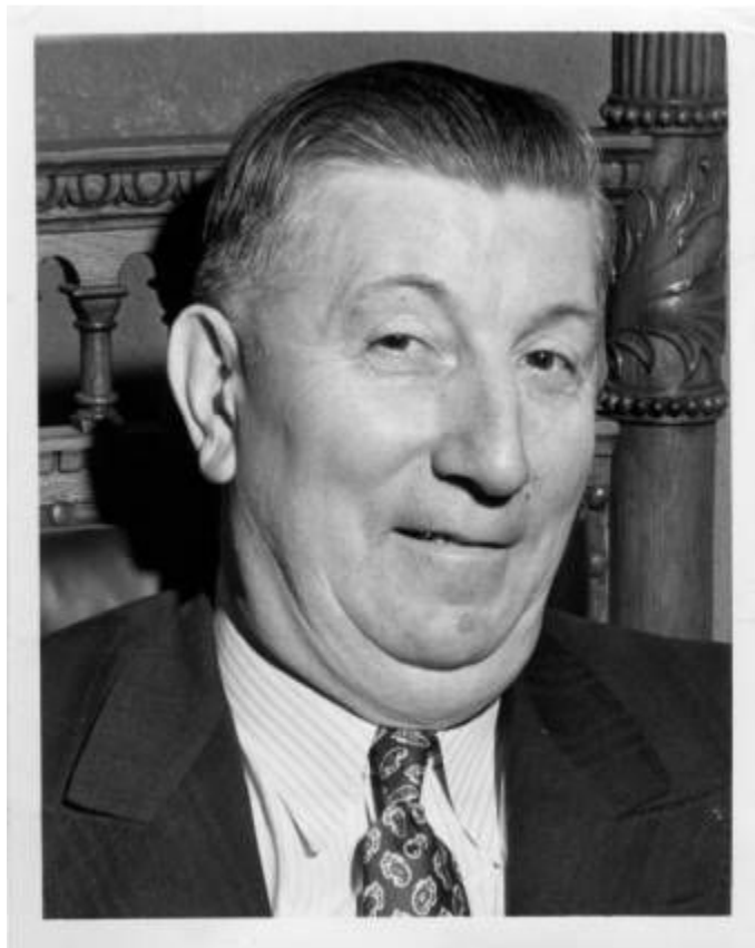
James G. Kehoe Judge of Probate Court, Hennepin County District Court Date: 1940s