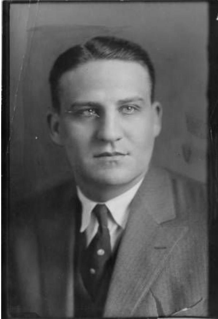
Judge Paul S. Carroll Date: April 19, 1927.