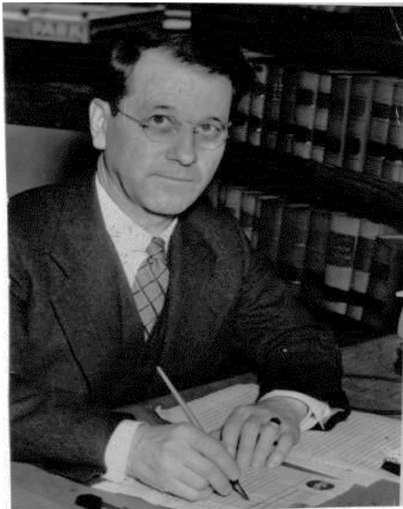
Judge Vince A. Day Date: December 4, 1936.