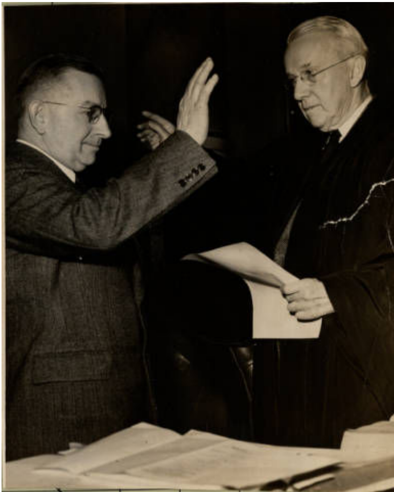
Judge Winfield W. Barwell administers oath to man identified only as LaBelle Date: November 1, 1942.