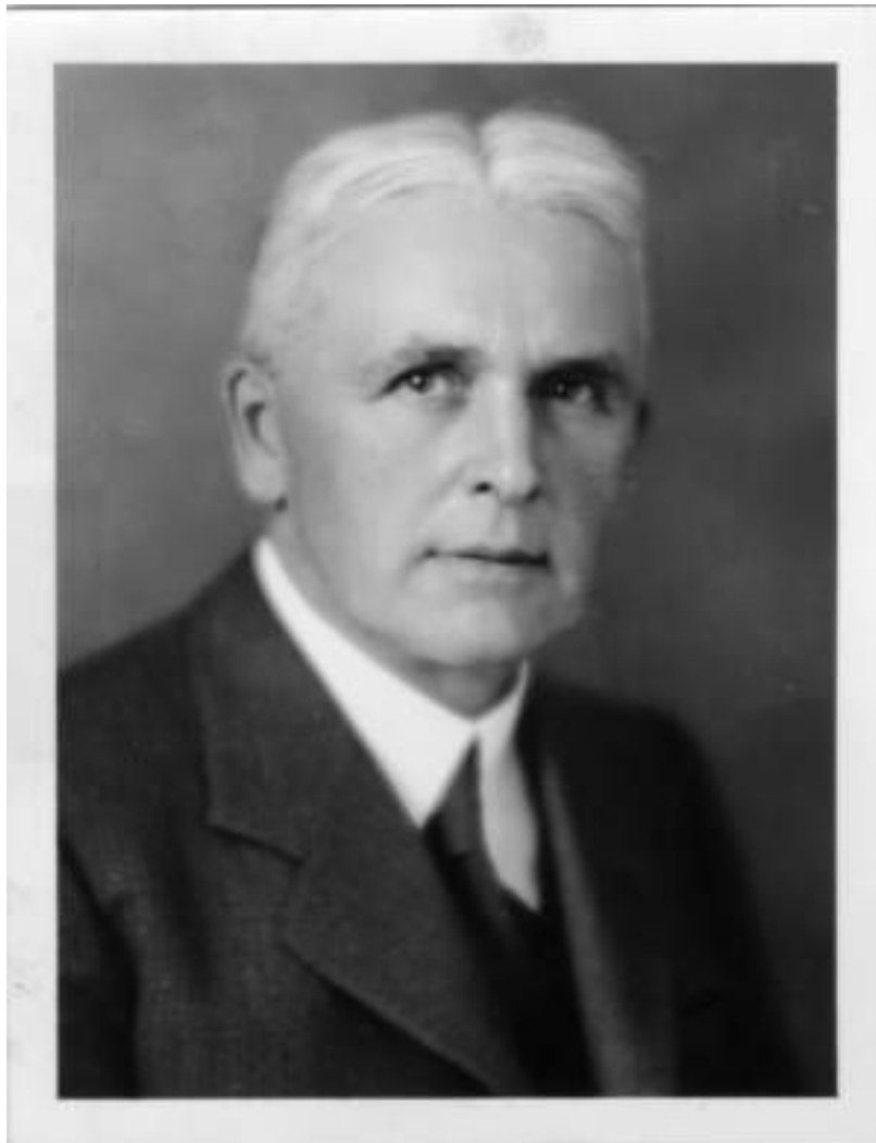
Judge Paul W. Guilford Date: October 10, 1935.