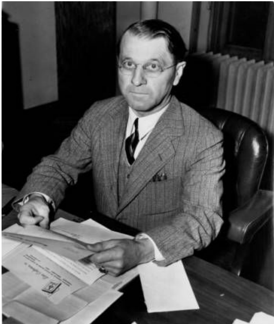
Judge Vince A. Day Date: October 6, 1938.