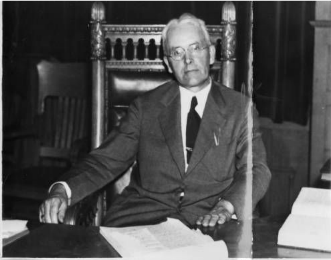
Judge Paul W. Guilford Date: September 19, 1935.