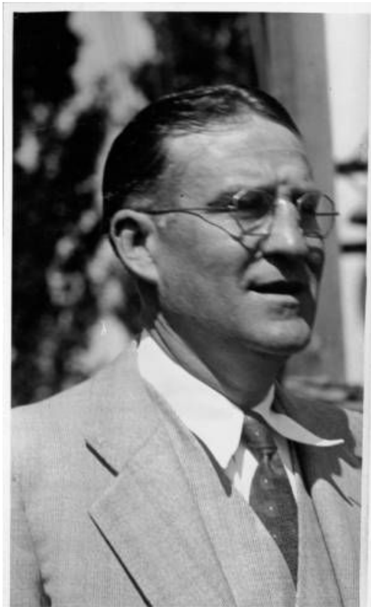
Judge Paul S. Carroll Date: May 30, 1935.